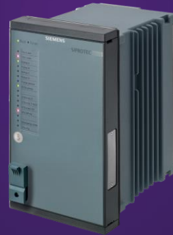
Merging Unit Siemens SIPROTEC 6MU85 flush mounted version