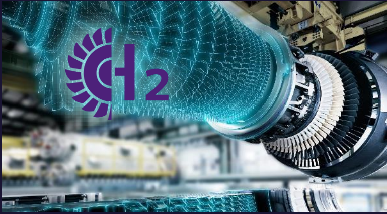
Low- or zero-emission power generation