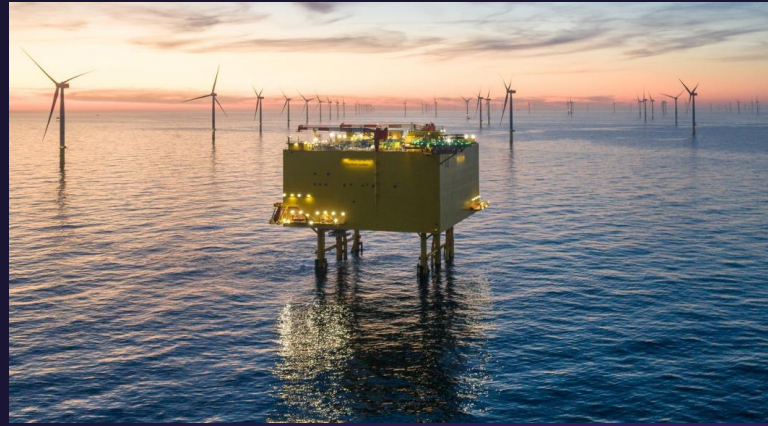
Transport of electricity and storage