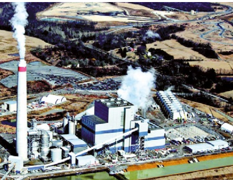
Longview Power LLC, USA

been built under the Benson license, with outputs ranging up to 1,300 MW(el) and steam pressures up to 350 bar. Since 2004, contracts have been signed for more than 80 steam generators with so-called ultra-supercritical steam parameters, i. e., with live steam temperatures in excess of 600 °C.