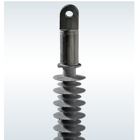
Siemens long rod insulator – type 3FL

Siemens AG Gas and Power Transmission Products Freyeslebenstrasse 1 91508 Erlangen Germany