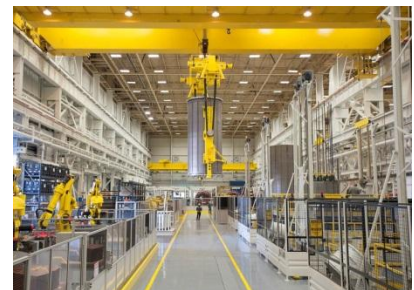
Siemens Charlotte Energy Hub: One million square feet of production and office space running 24 hours a day

Siemens Engineering welcomes your custom requirement and will design and work with you to deliver solutions that meet your challenging needs.