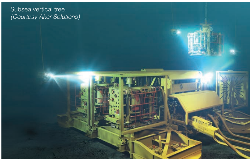
Subsea vertical tree.

According to Aker Solutions Senior Product Specialist Lars Lundheim, both are equipped with flow modules that define the duty of the tree (i.e. producer, gas injector, water injector). "This also means that there is one common tree for all duties," he ex-