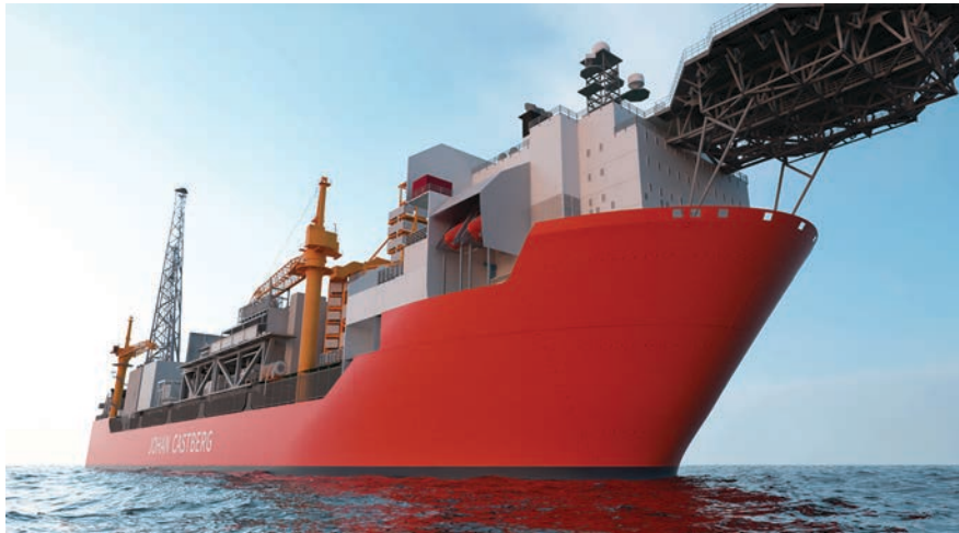
The Johan Castberg FPSO.

The Johan Castberg FPSO will be the first offshore application of Siemens' SGT-750 gas turbine – a 41-MW version will drive a