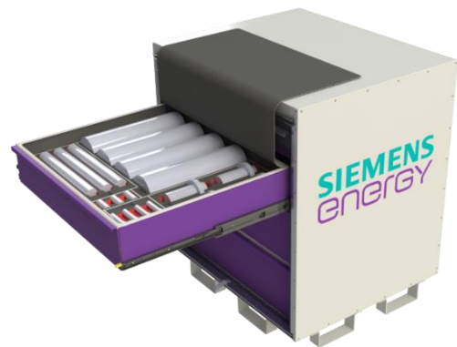
Figure 1: Kit with Spare Parts

inlets for different components. An ecofriendly re-sealable preservation will safeguard the integrity of your parts for up to 5 years. In the box the parts can be easily identified thanks to the corresponding labeling. Access to the parts for your maintenance personnel or Siemens Energy Field Service personnel is easy as the parts have dedicated locations in the drawers of the box(es). A corresponding documentation will come along with the boxes.