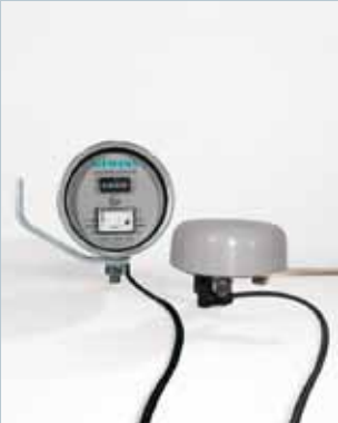
Sensor and display