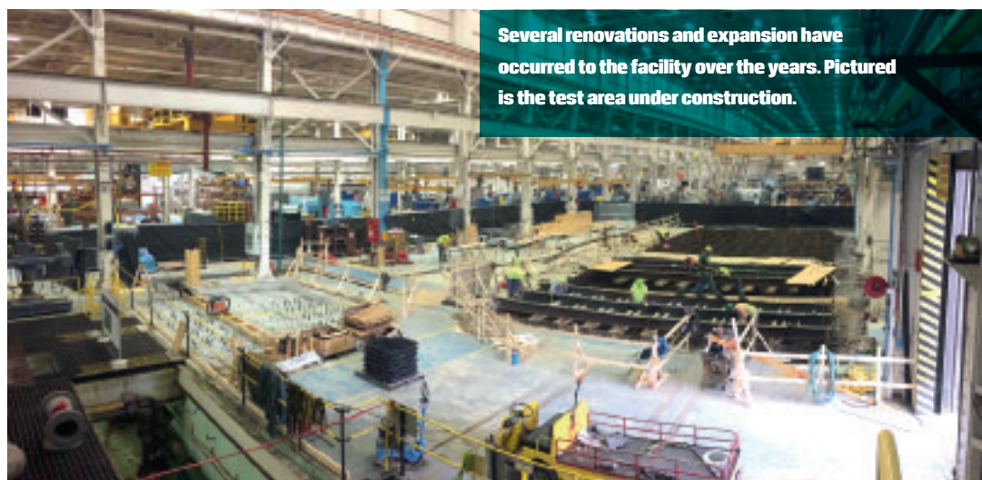
Several renovations and expansion have occurred to the facility over the years. Pictured is the test area under construction.