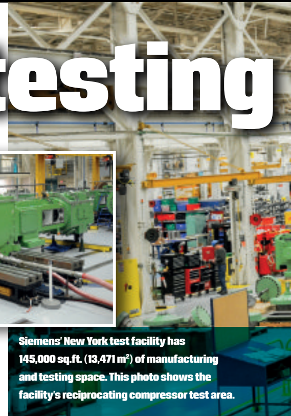
Siemens' New York test facility has 145,000 sq.ft. (13,471 m 2 ) of manufacturing and testing space. This photo shows the facility's reciprocating compressor test area.

Several renovations and expansion have occurred to the campus over the years to keep pace with the changing demands of the industry and the development of new technologies. In 1991, an additional testing facility was added to perform full-load, full-pressure (FLFP) hydrocarbon (natural gas) tests that duplicate the conditions that a compressor experiences in the field. The facility provides compressor operators with the assurance that the compressor train will operate as designed for critical services in the field, such as offshore environments,