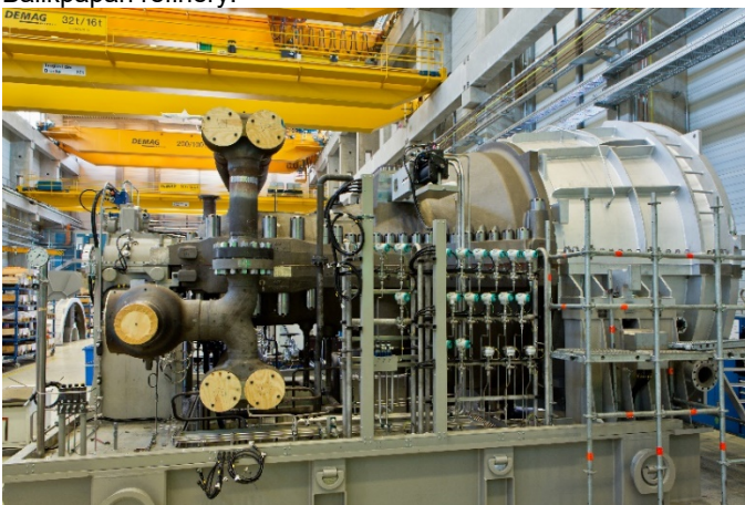
Above: Siemens SST-600 steam turbine tailor-made design; actual design depends upon project conditions.