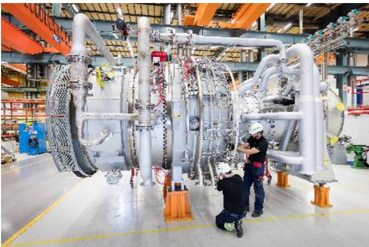
Above: Four SGT-800 industrial gas turbines will enable the cost-effective expansion of the Balikpapan refinery.