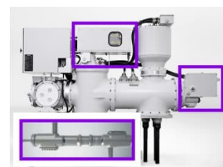
Large components, e.g. spring drive mechanisms or interrupter units