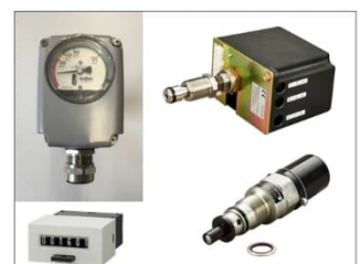
Single spare units or parts, e.g. density monitors or pressure switches

All spares are supplied in high quality and with Siemens Energy material warranty. For all maintenance or repair work we offer the fastest possible solution with our certified service experts.