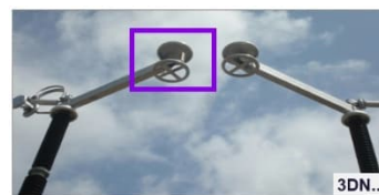
e.g. Center Break type