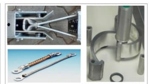
Single spare units or parts e.g., contact fingers, terminal connectors and flexibles