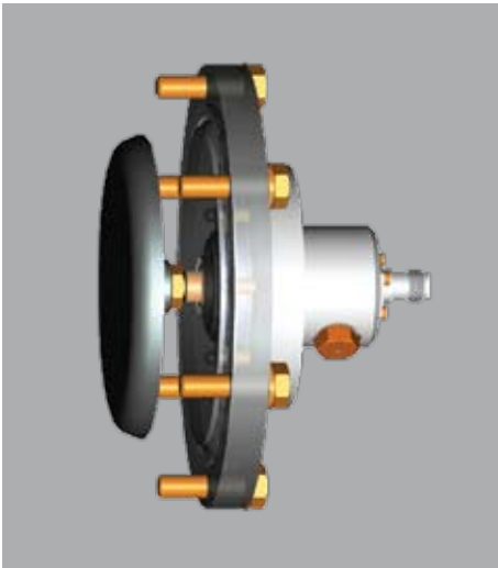
Gas-tight measurement bushing with electrode

The major components of each voltage detection system are: