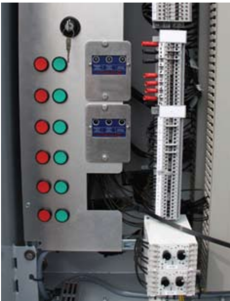
Control cabinet units for the monitoring of two outgoing units

The possibility of influence from external interference is eliminated thanks to the optical fiber transmission link. This constantly ensures that the voltage condition is displayed correctly in the control cabinet.