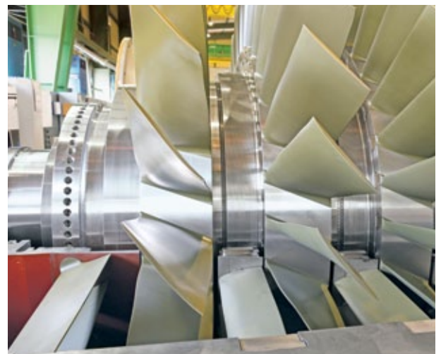
Advanced compressor blades

The Service Package 4 upgrade can be a cost-effective way to improve the overall performance of your gas turbine and combined cycle power plant integrating various technical solutions.