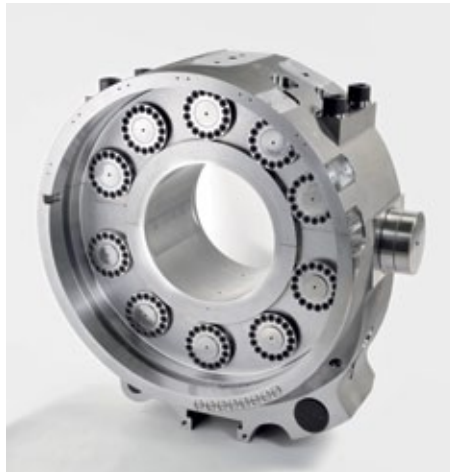
Hydraulic Clearance Optimization bearing