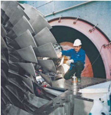
Implementing the compressor modifications